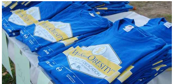
2010 Walk from Obesity T-shirt

T-shirts are provided to every paid Walk participant. The number of t-shirts that are provided will be determined by the National office based on the number of participants in past events and current registration numbers at the time the order is placed. The t-shirts are a great way to recognize our National Sponsors, and the Presenting and Local Sponsors. Since most companies will want to be recognized on the t-shirt, it is a great selling point when soliciting for Local Sponsors. Please review the Local Sponsorship Prospectus provided by the National Office for information on which levels of sponsorship include recognition on the t-shirt. All paid Presenting Sponsors should be recognized on the t-shirt. The printing of local logos will be provided by the National Office. More information and deadlines will be provided by the National Office.