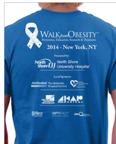
Back of T-shirt Example

Presenting Sponsors. Together the Presenting Sponsor and the ASMBS Foundation will bring this important event to your community. Countless hours and lots of hard work from local volunteers will help to present this educational and awareness event, while raising funds for obesity research, education, prevention, and treatment.