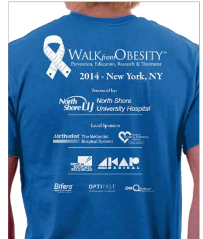
Back of T-shirt Example

Presenting Sponsors. Together the Presenting Sponsor and the ASMBS Foundation will bring this important event to your community. Countless hours and lots of hard work from local volunteers will help to present this educational and awareness event, while raising funds for obesity research, education, prevention, and treatment.