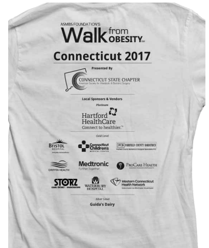
Back of T-shirt Example

Presenting Sponsors. Together the Presenting Sponsor and the ASMBFS Foundation will bring this important event to your community. Countless hours and lots of hard work from local volunteers will help to present this educational and awareness event, while raising funds for obesity research, education, prevention, and treatment.