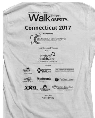
Back of T-shirt Example

Presenting Sponsors. Together the Presenting Sponsor and the ASMB's Foundation will bring this important event to your community. Countless hours and lots of hard work from local volunteers will help to present this educational and awareness event, while raising funds for obesity research, education, prevention, and treatment.