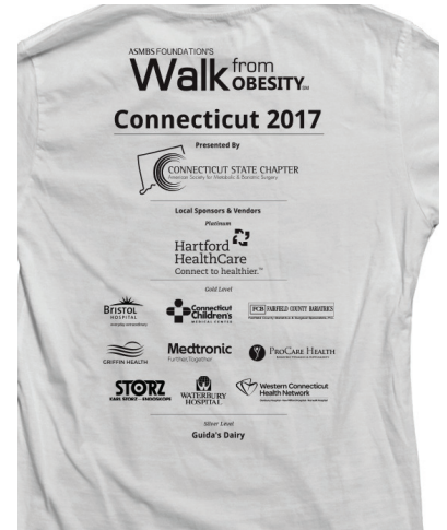
Back of T-shirt Example

PRESENTING SPONSORS. The Presenting Sponsor of your local Walk has already committed sponsorship dollars, as well as countless volunteer hours to plan your local Walk from Obesity. This sponsor and the ASMBS Foundation will work together to create a great event for your community.