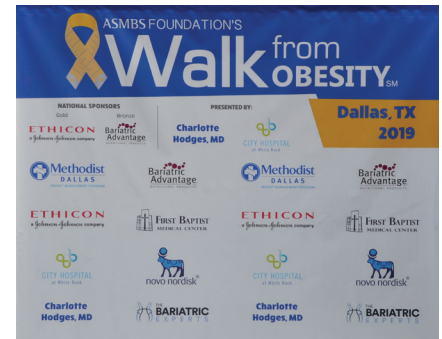
Step and Repeat Banner Example,