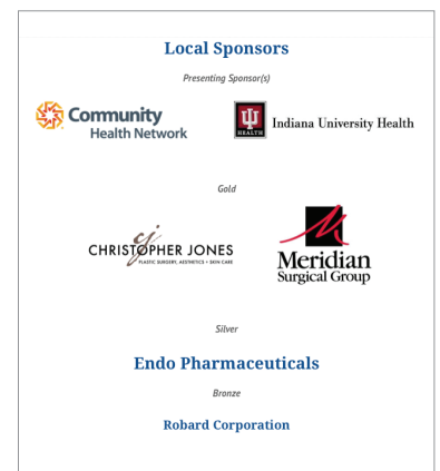
Registration Page Example

Individuals that support the participants with a donation or financial pledge are also an integral part in this inspiring event.